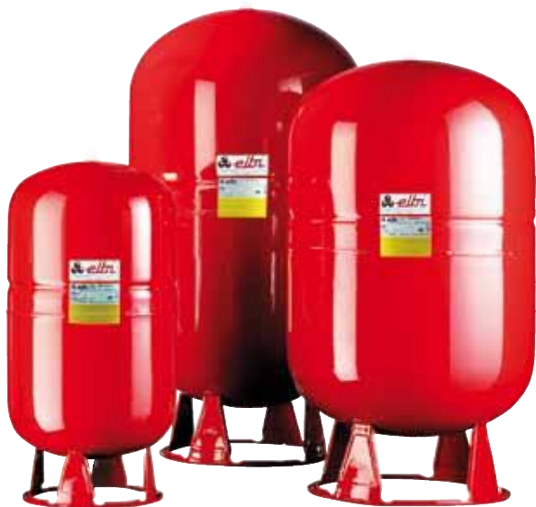
ERCE 35 - 50